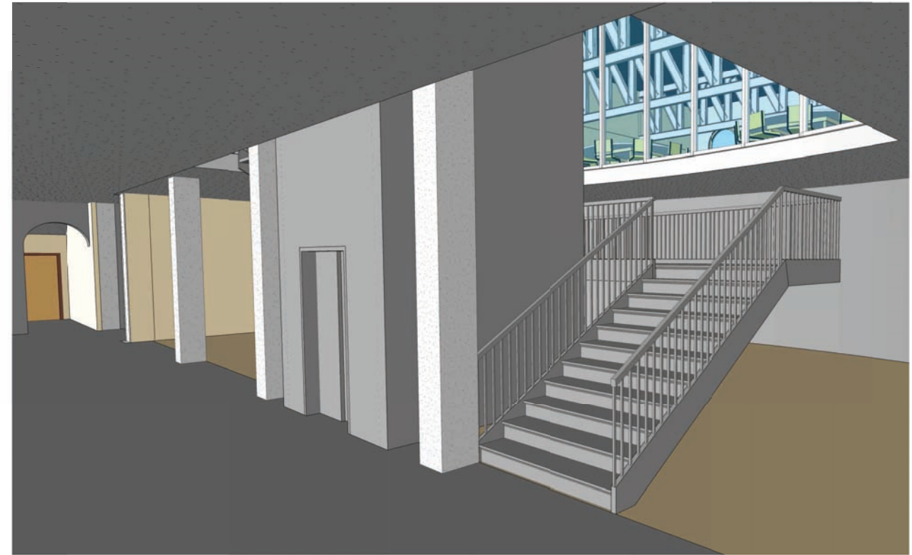
Option 3 - Gathering Space