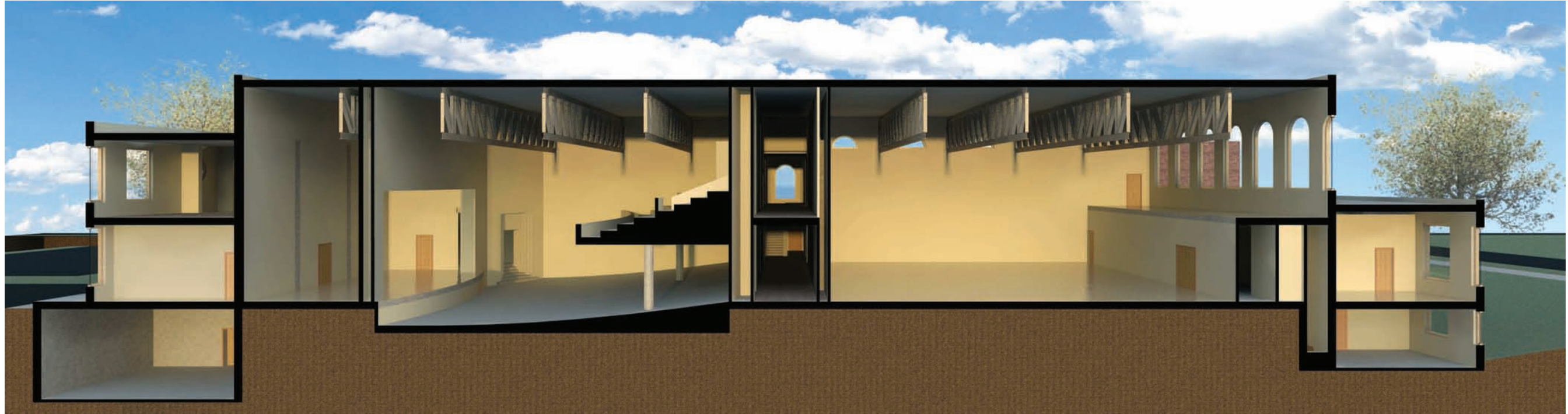
Cross Section - Existing Building