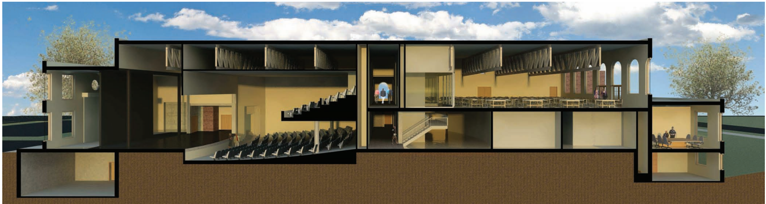
Cross Section - Option 3